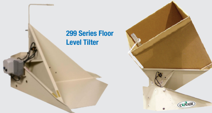
299 Series Floor Level Tilter