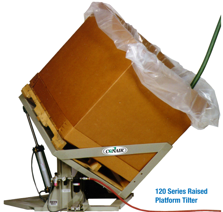
120 Series Raised Platform Tilter

The tilters can be used beside your processing machines or in remote central material storage rooms to assure a constant flow of material throughout your plant. Once emptied, simple foot- or hand-operated controls level the container for removal and replacement.