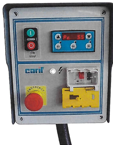
Variable Speed Console