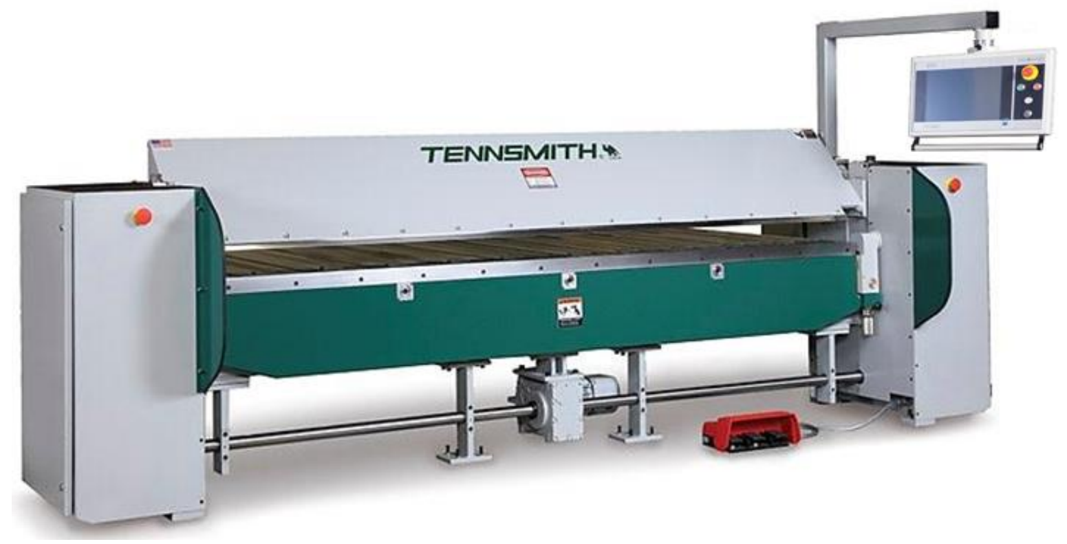
SBS 126-14 Folding System

The Tennsmith SBS Series mechanical folding system utilizes a low maintenance design, coupled with an array of standard features for an attractive combination of high value and solid performance.