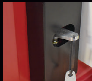
Pinch Gap Control