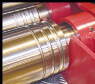
Round Bar Grooves