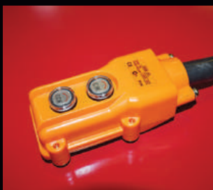
Hand-Held Rotation Control