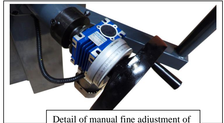
Detail of manual fine adjustment of downfeed with 0.0004" graduations. Wheelhead Elevation Motor shown.