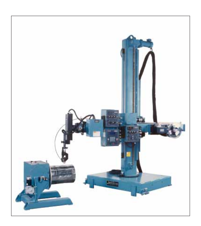
WHL-4D with kingpin car and equipped with 9500 controlled plasma welding system

machined as this type of car and track are used primarily for positioning of the weld head locator. Facilities are provided on the track for fixing it to the floor and the car is fitted with a safety device to avoid the weld head locator overbalancing. Fixing the track to the floor is very important if the weld head locator is to carry heavy loads at full boom extension.