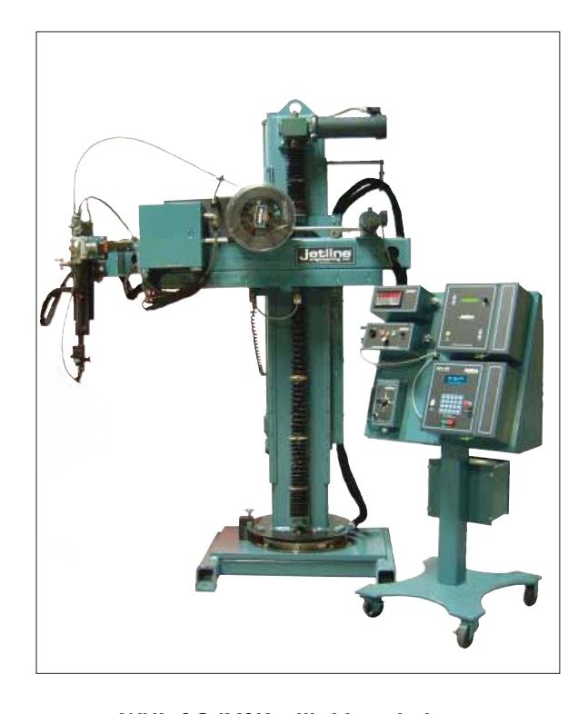
WHL-3C4X3K with kingpin base

All systems are supplied complete with powered lift which has variable speed control. The standard