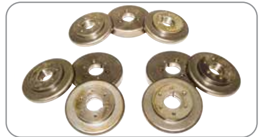
Universal Tooling Set Included for Multiple Profiles