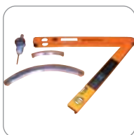
Radius & Degree Measuring Kit