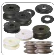
Pipe & Tube Tooling