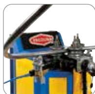
Large Spiral Accessory