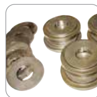
Modular Tooling Set