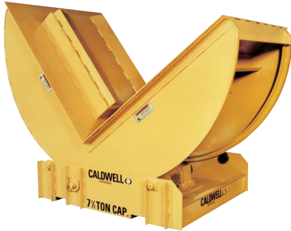
Shown with V-Block Option