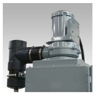
The "ZXX" Configuration