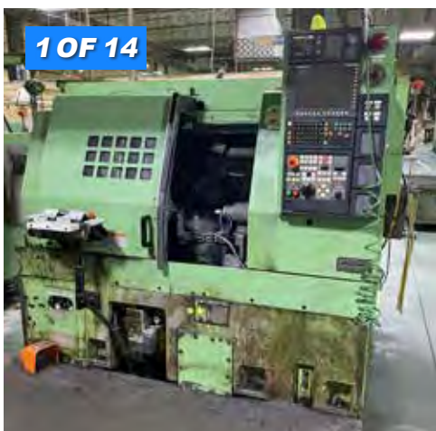
1 OF 14

Over 1,000 items for sale! Major items include: Complete Machining Facility with Mori CNC Lathes, Shigiya Grinders, Complete Heat Treat Department, Multi-Spindle Gun Drills, Metals Lab, Air Compressors, Forklifts, Lincoln Welders, Complete Tool Room and Maintenance Shop, Spare Parts and lots more.