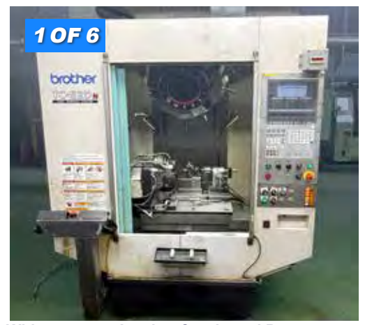
1 OF 6

In Conjunction With: Auction Conducted By: