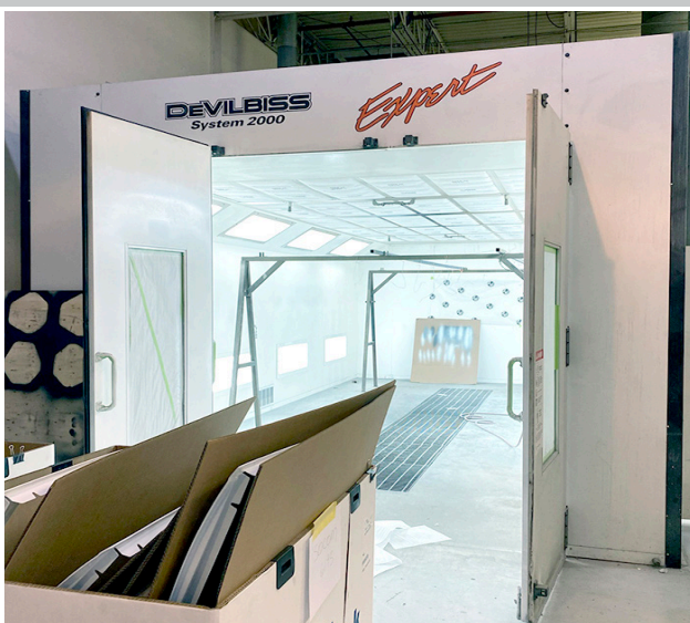
DEVILBISS SYSTEM Downdraft Pressurized Spray Booth