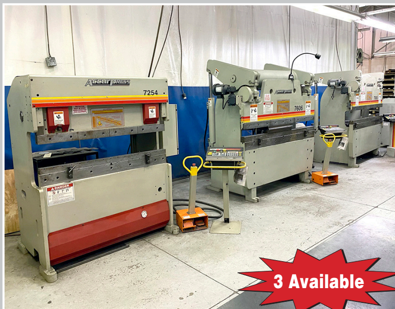
ACCURPRESS Hydraulic Press Brakes