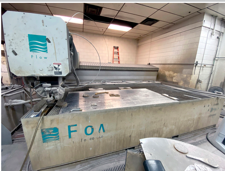
FLOW HYPERJET Waterjet System