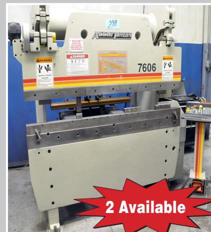
ACCURPRESS 6' x 60-Ton Press Brake