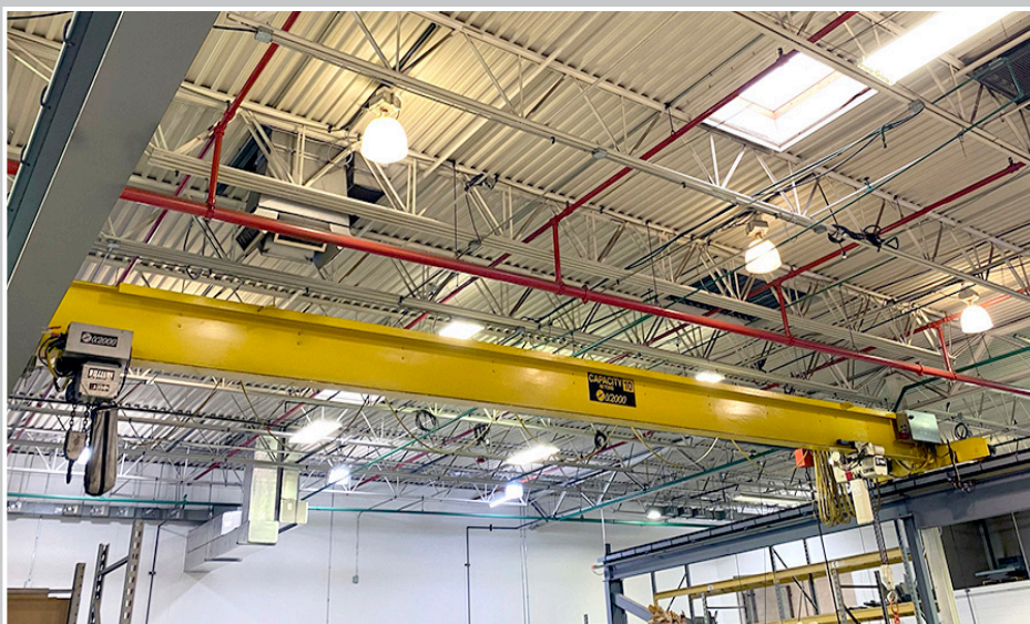
ALPHA 2000, 10-Ton Overhead Bridge Crane