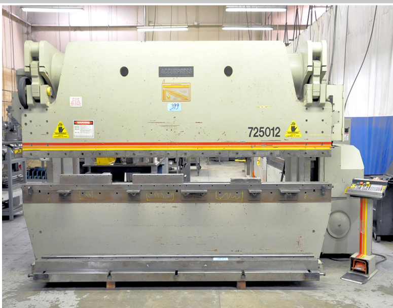
ACCURPRESS 12' x 250-Ton Hydraulic Press Brake