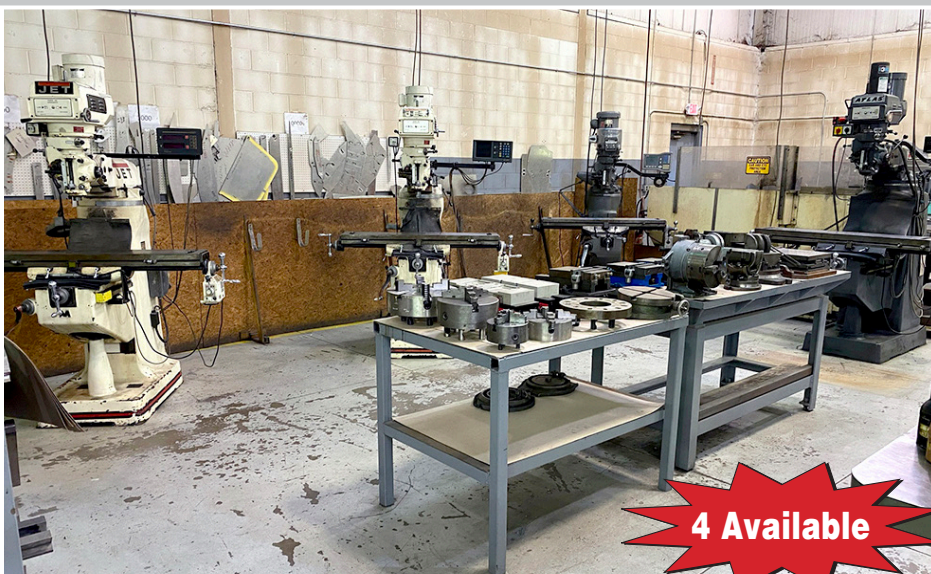
Vertical Milling Machines