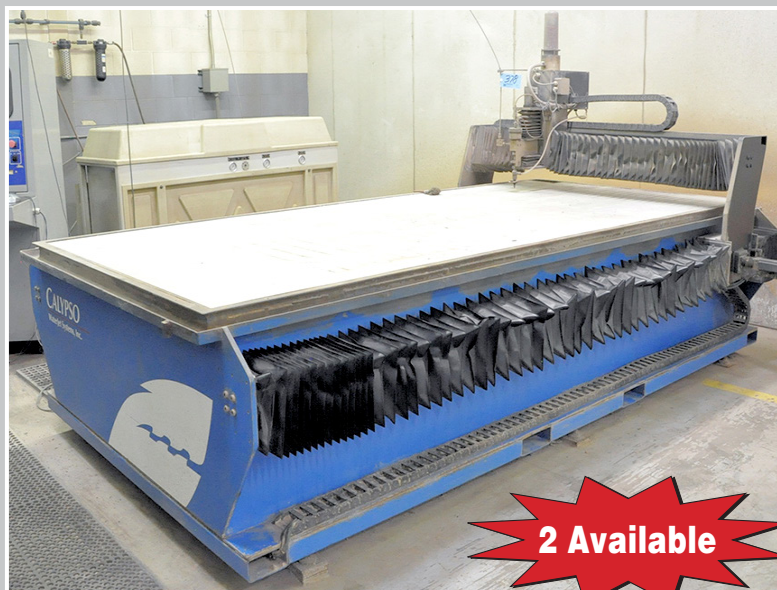
CAPLYSO Waterjet Systems