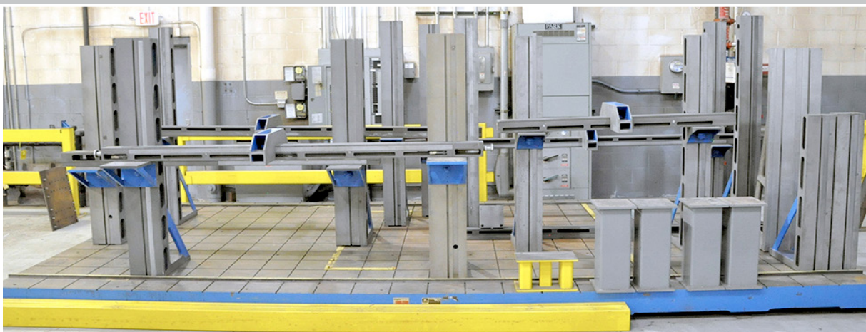
NORTON Styling System Platform Set