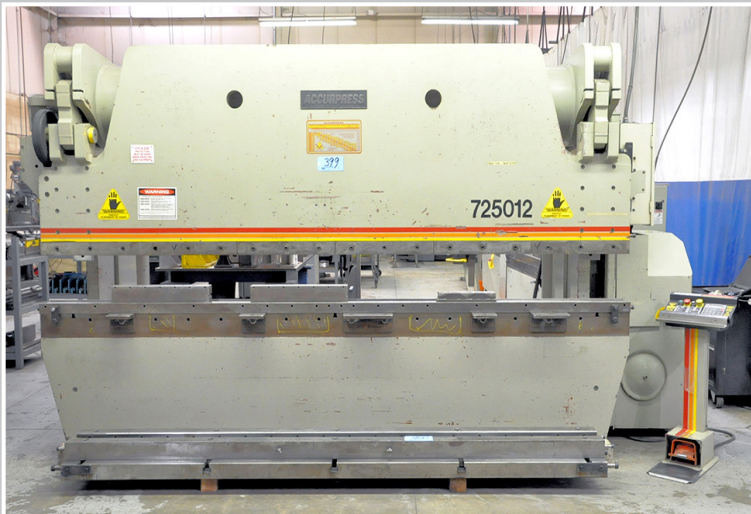
ACCUPRESS 12' x 250-Ton Hydraulic Press Brake

Online Only Auction | No On-Site Bidding