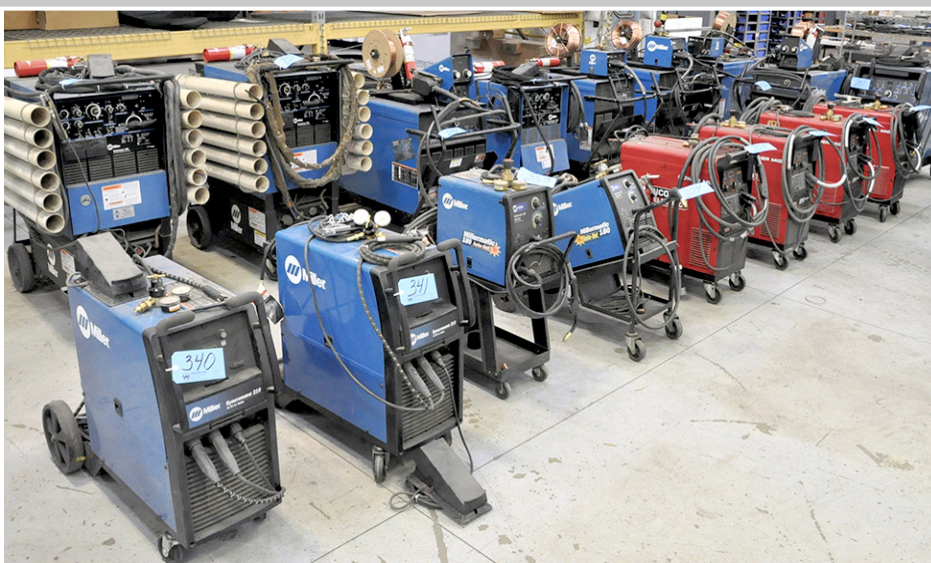
Large Assortment of MILLER and LINCOLN Welders