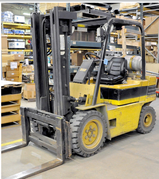
CATERPILLAR GC30K, Cushion Tire Forklift