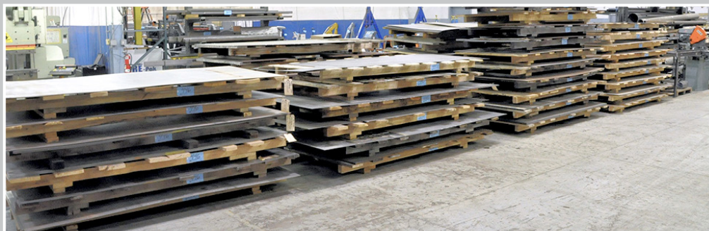
Large Assortment of Sheet Metal and Plate Stock