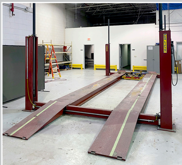
PKX 30,000 Lb. Capacity Truck/Bus Lift