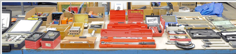
Large Assortment of Inspection Equipment