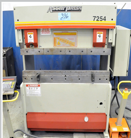
ACCURPRESS 4' x 25-Ton Press Brake