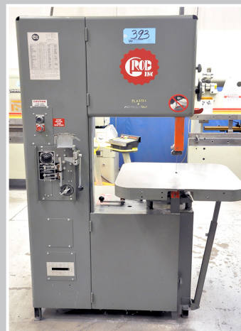
GROB 4V-18 Vertical Bandsaw