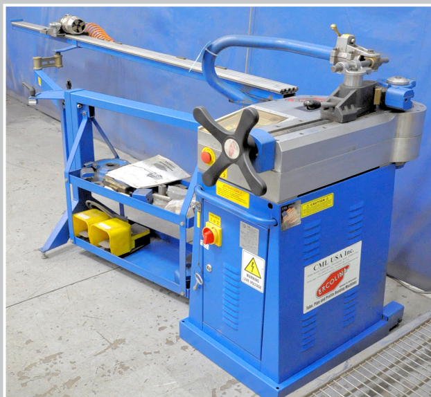
ERCOLINA TB-76 Programmable Bender