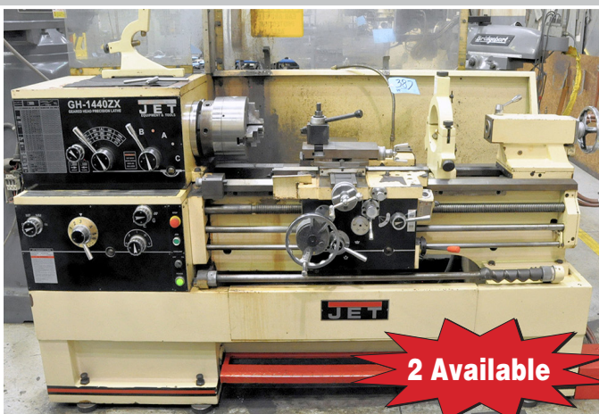
JET GH-1440 ZX & GH-1340W-3 Toolroom Lathe