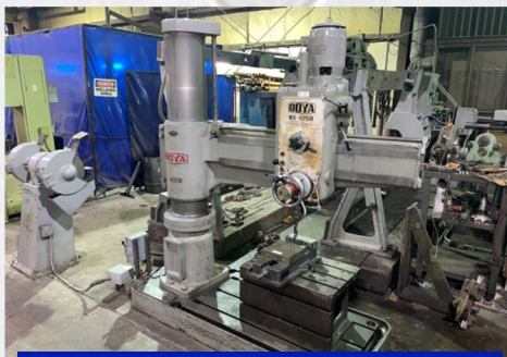
Ooya RE-1250 Radial Drill