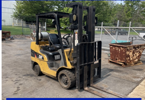
CAT 5,150lb LPG Fork Lift