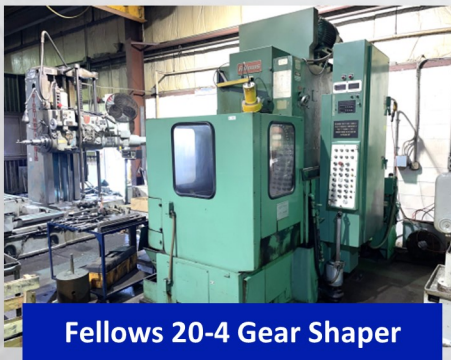
Fellows 20-4 Gear Shaper