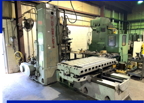
G&L Horizontal Boring Mill