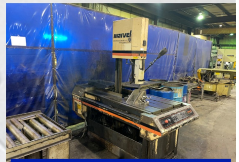
Marvel 8 Mark II Band Saw