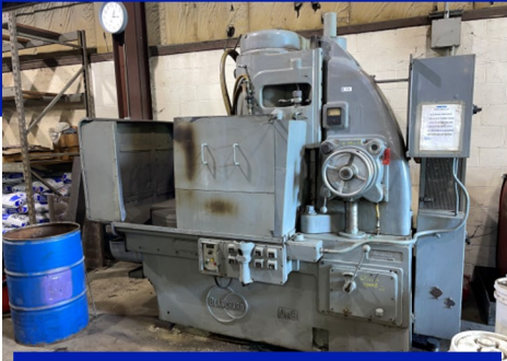
Blanchard No 18 Rotary Grinder