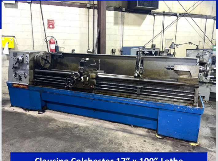
Clausing Colchester 17" x 100" Lathe