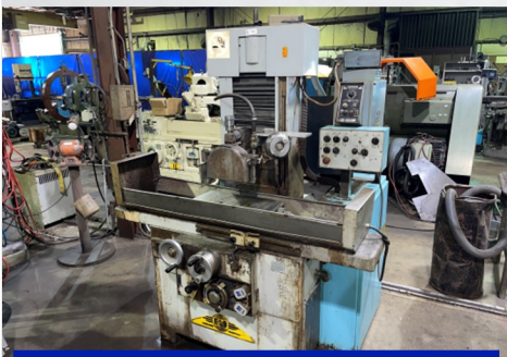
ELB Werkzeug Surface Grinder