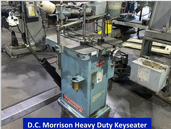
D.C. Morrison Heavy Duty Keyseater