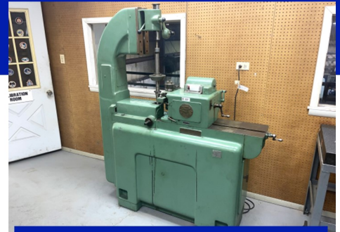
Fellows Redliner Gear Tester