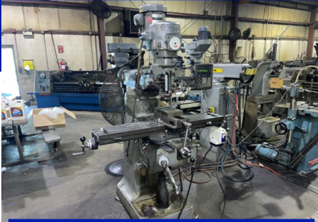
Bridgeport Vertical Knee Mill