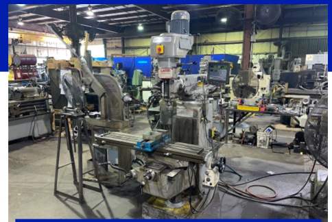
Lagun Vertical Knee Mill