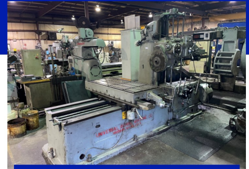
Universal Horizontal Boring Mill