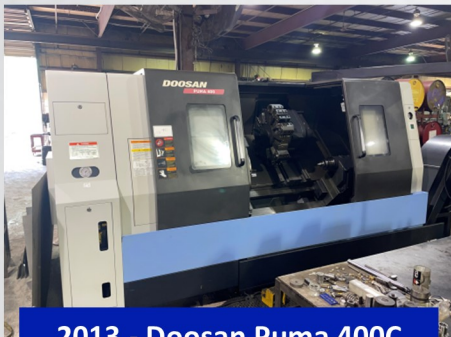
2013 - Doosan Puma 400C

Public Inspection · Wednesday, June 18th from 8:00am - 3:00pm