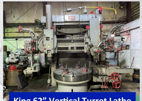
King 62" Vertical Turret Lathe