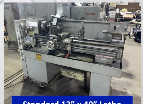
Standard 13" x 40" Lathe