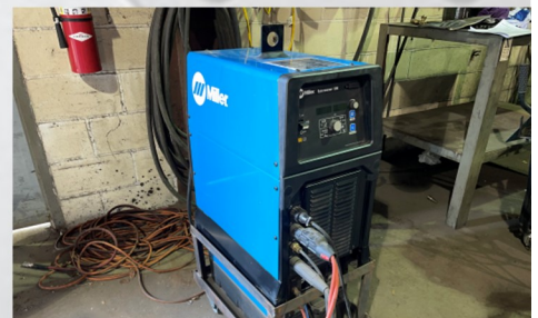
Miller Syncrowave 300 Welder