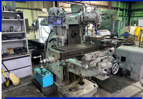
Cincinnati No. 3 Universal Mill