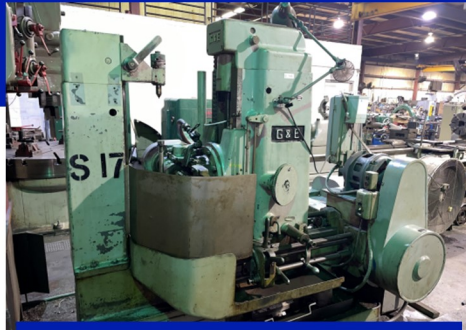
Gould & Eberhardt Gear Hobber