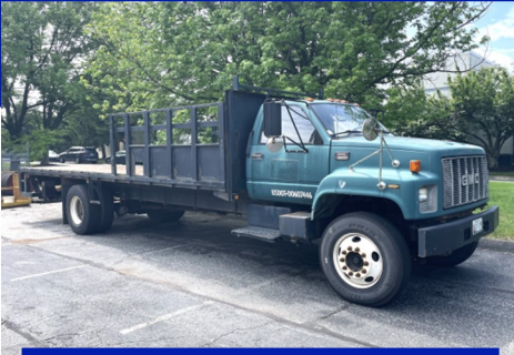
2001 - GMC C6500 Diesel Truck