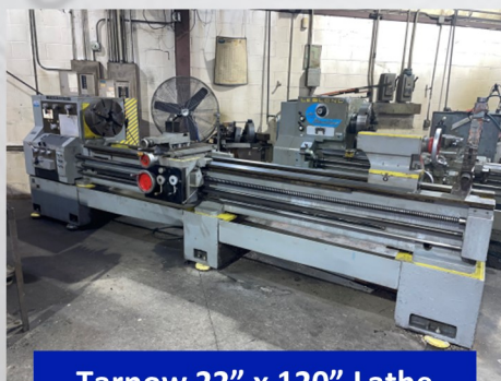
Tarnow 22" x 120" Lathe