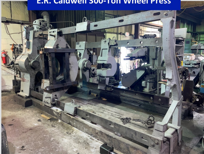
E.R. Caldwell 300-Ton Wheel Press