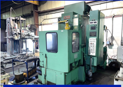
Fellows 20-4 Gear Shaper