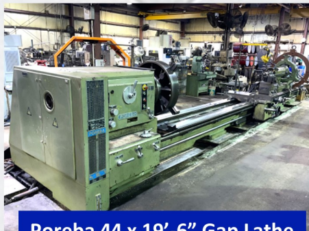
Poreba 44 x 19'-6" Gap Lathe