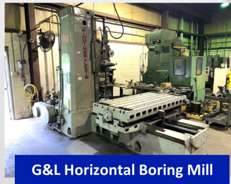
G&L Horizontal Boring Mill