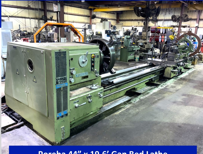
Poreba 44" x 19.6' Gap Bed Lathe