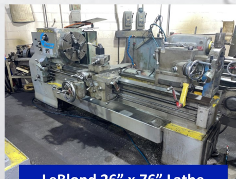
LeBlond 26" x 76" Lathe