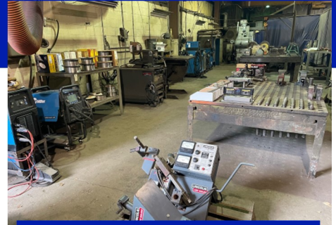
Large Welding Department