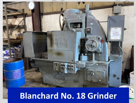
Blanchard No. 18 Grinder