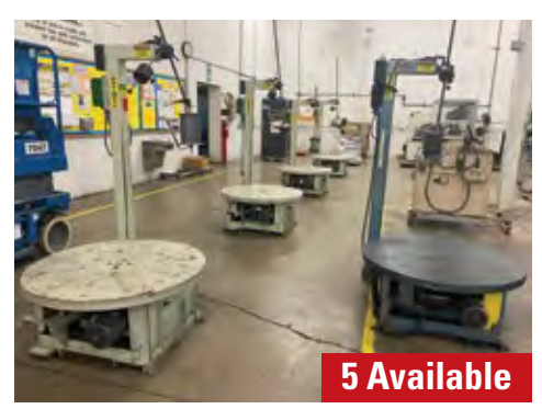
COILMATE CM3042 PALLET DECOILERS