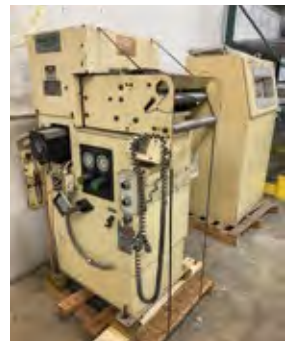
MINSTER MEF3-10 FEEDER