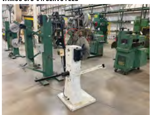
ASSORTED STRAIGHTENERS AND REELS