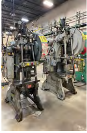
VIEW OF WALSH OBI PRESSES

To avoid any public gatherings, there will be no onsite participation in this Webcast-only auction.