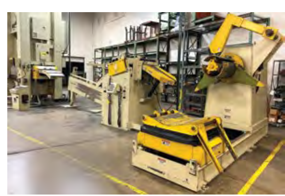
COE 10.000 LB X 24" COIL FEED LINE

P/A INDUSTRIES SRF-12 ADVANTAGE Servo Feed, s/n 1450893