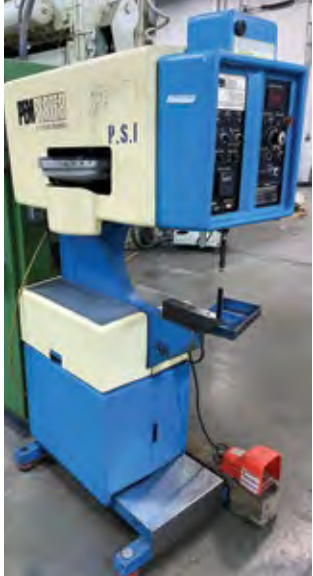
PEMSERTER PS-1000 INSERTION PRESS

PEMSERTER PS-1000 Insertion Press, s/n 100-B036, 8 Ton,