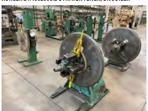
LITTELL AUTO CENTERING REELS