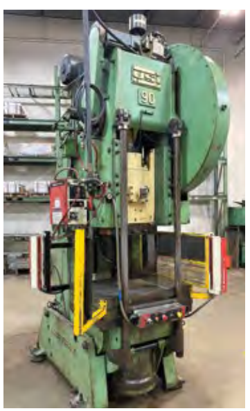
USI CLEARING NO. 90 OBI PRESS

MINSTER B1-32 OBI High Speed Press, s/n B1-32-12889, 32 Ton Capacity, 24"x 15" Bed, 10.25" Shut Height, 2.25" Adjustment, 1" Stroke, 200, 400 SPM