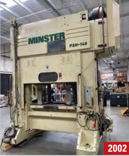
MINSTER P2H-160 PRECISION STRAIGHT SIDE PRESS