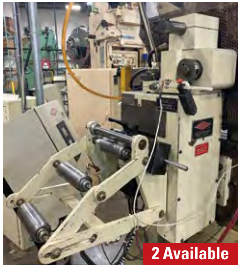
VAMCO CFS-6 II SERVO FEED

MITSUBISHI FX-20 CNC WIRE EDM, s/n na, w/ Mitsubishi W11FX2 Control