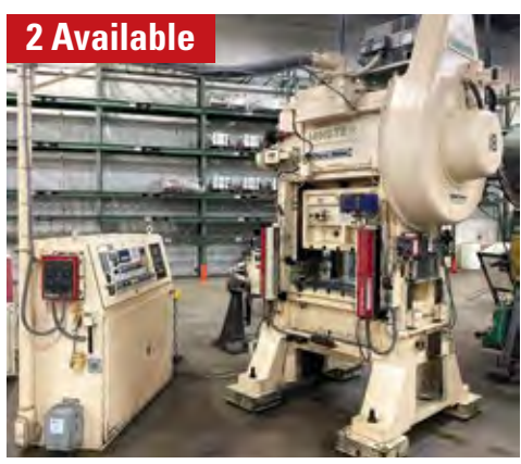
MINSTER P2-60 PIECE-MAKER HIGH SPEED PRESS

View our current auction schedule at perfectionindustrial.com