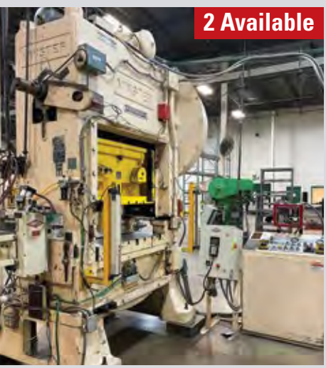
MINSTER P2-100-48 PIECE-MAKER HIGH SPEED PRESS

SALE DATE: Thursday, May 28 at 11:00 AM CT