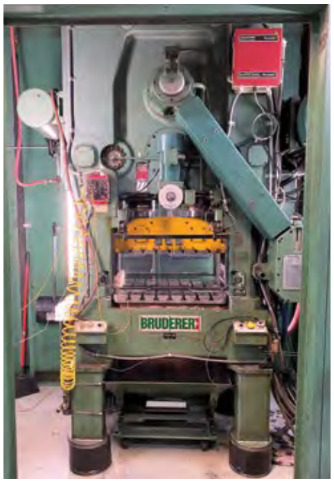
BRUDERER BSTA 6011 HIGH SPEED PRESS

View our current auction schedule at perfectionindustrial.com