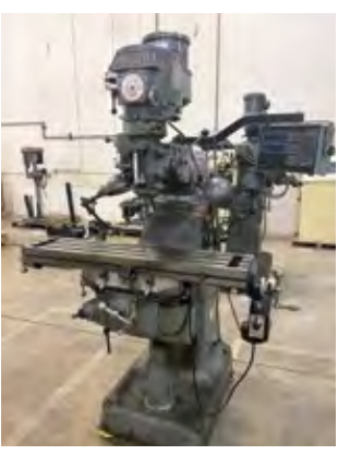
ALLIANT 42-S VERTICAL MILL

SEARS ROEBUCK 113.213780 15" Drill Press, s/n 2347.P0053