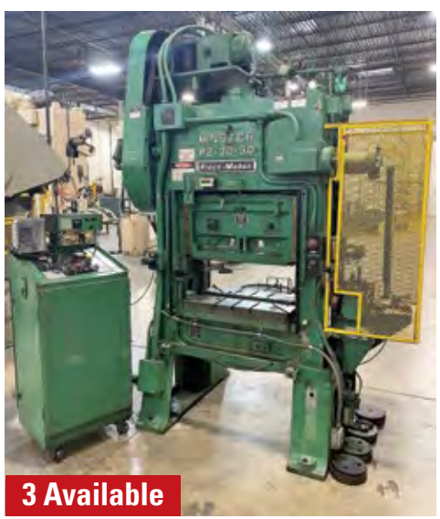
MINSTER P2-30-30 PIECE-MAKER HIGH SPEED PRESS

BRUDERER BSTA 30 High Speed Press, s/n 4627, 30 Ton Capacity, 100-800 SPM, .375-1.57" Stroke (Adjustable), 8" Shut Height, 21" x 17" Bed Area