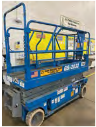
GENIE GS-2032 SCISSOR LIFT