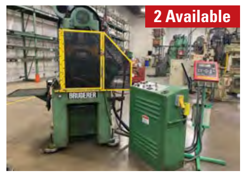
BRUDERER BSTA 30 HIGH SPEED PRESS