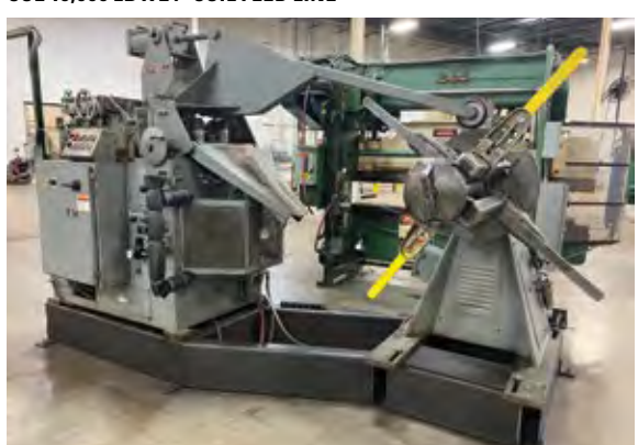
LITTELL & P/A INDUSTRIES 4,000 LB X 18" COIL FEED LINE