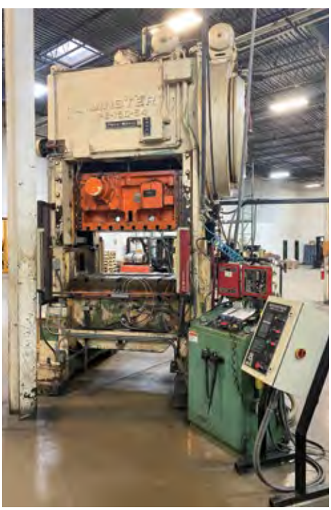
MINSTER P2-150-54 STRAIGHT SIDE PRESS

MINSTER P2-150-54 Straight Side Press, s/n P2-150-19233, 150 Ton Capacity, 54"x 40" Bed, 20" Shut Height, 4" Adjustment, 6" Stroke, 45-90 SPM, w/ Wintriss Autoset PAC Load Analyzer and SmartPAC Automation Control