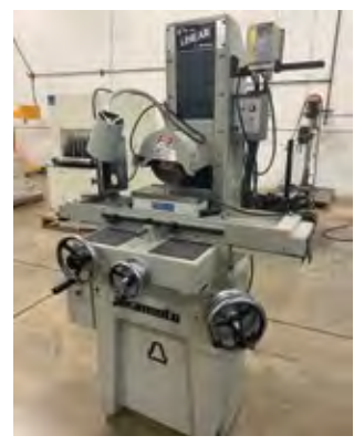
OKAMOTO LINEAR 612 SURFACE GRINDER