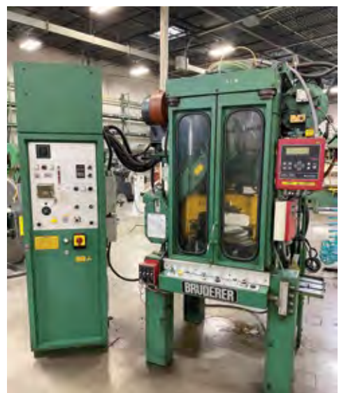
BRUDERER BSTA 22-E HIGH SPEED PRESS

MINSTER P2-30-30 Piece-Maker High Speed Press, s/n P2-30-19341, 30 Ton Capacity, 30" \times 19" Bed, 150-450 SPM, 2" Stroke, 11.5" Shut Height, w/ PERFECTO 300-6 Feed, s/n F3-3643-1