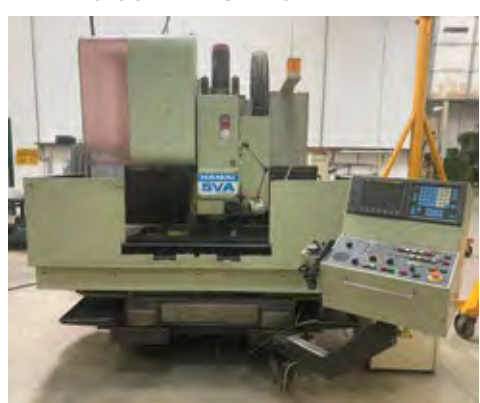
HAMAI MC-5VA VERTICAL MACHINING CENTER