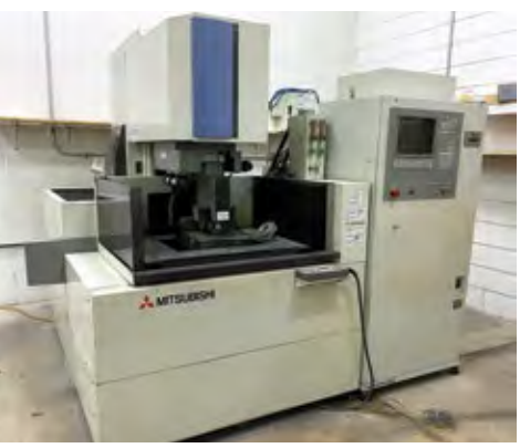
MITSUBISHI FX-20 CNC WIRE EDM