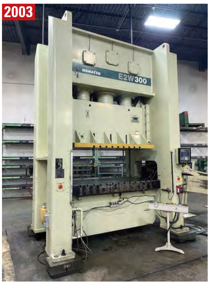
KOMATSU E2W 300 STRAIGHT SIDE PRESS