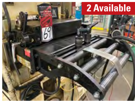
P/A INDUSTRIES SRF-12 SERVO FEED

Also Available, SMW 200T Setup Switcher, s/n na, 39.5" x 40" Table