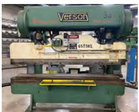
VERSON 65 TON PRESS BRAKE