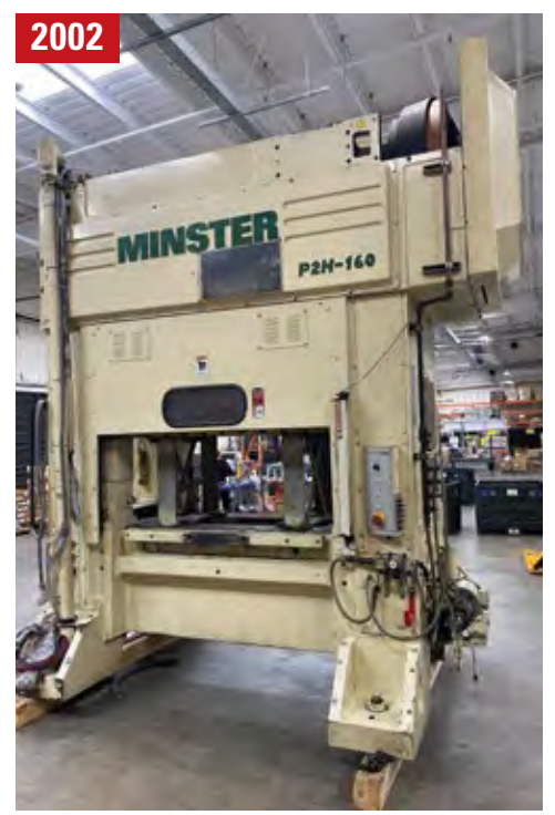
MINSTER P2H-160 PRECISION STRAIGHT SIDE PRESS

BLISS HP2-200-60-42 Straight Side Press, s/n H63044, 200 Ton Capacity, 60"x 42" Bed, 2.5" Stroke, 70-135 SPM, 10-16" Shut Height, 6" Adjustment, Wintriss SmartPac 2 Control, WPC Clutch/Brake Control