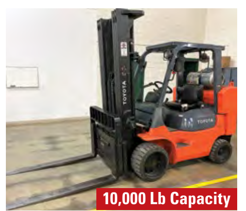
TOYOTA 7FGCU45-BCS LP FORKLIFT